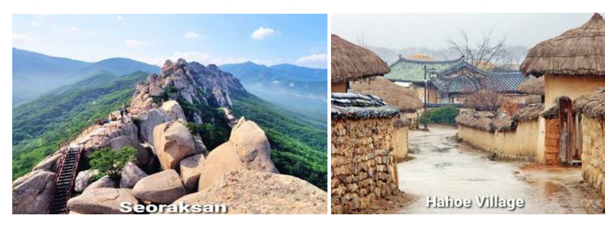
<u>Day 7 UNESCO ANDONG HAHOE FOLK VILLAGE</u> Today we will travel to Andong cit via Wongju or Donghae by express bus and train. From Andong, we take a local bus westward to UNESCO world heritage site Hahoe Folk Village. The village has tile-roofed centuries old buildings and homes. It has been visited by tourists included Queen

<u>Day 6 SOREAKSAN NATIONAL PARK</u> We take local bus to Soreaksan National Park, the most popular National Park in Korea. There are various ways to explore the place. One can cable car up to Gwongeumseong for amazing views of the park. The Sinheungsa Temple and surrounding area along the stream just nice to wander for its nature. Others can trek to Heundelbawi (Tottering Rock) and for fitter ones, proceed on to Ulsanbawi, which are the huge stone mountains, accessible via long and steep metal stairways. Later afternoon, it's free and easy activities around hotel e.g. Sokcho beach, lakdeside walkway, and nearby market or simply rest after morning's climb. ON Sokcho