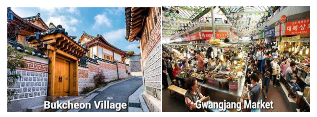
<u>Day 4 SEOUL TOWER & LOCAL MARKETS</u> Before visitng the Tower, we have brunch at Gwangjang Market, one of the oldest & largest in Korea, to taste some local most popular traditional food. Seoul Tower, aka Namsan Tower, it is a communication and observation tower located on Namsan Mountain in central Seoul. At 236m, it marks the highest point in Seoul. Then, we move to Namdaemun "Great Southern Gate", it has the large traditional market offers authentic local foods, and selling various affordable goods from personal items, indoors and outdoors items. After lunch, we move to nearby trendy Myeongdong shopping district, and upmarket Hyundai Duty Free Departmental Store. ON Seoul.

also home to country's top plastic surgery clinics and K-Pop entertainment companies. We visit the COEX Mall (largest underground shopping mall in Asia) in Gangnam, then the tallest in Korea and world's 5th tallest building, Lotte World Tower-Mall, and Seokchon Lake Autumn trees. On the way back to hotel, we may have dinner at Ikseondong, Seoul's hipster maze-like streets of restaurants, cafes and handicraft shops. ON Seoul.